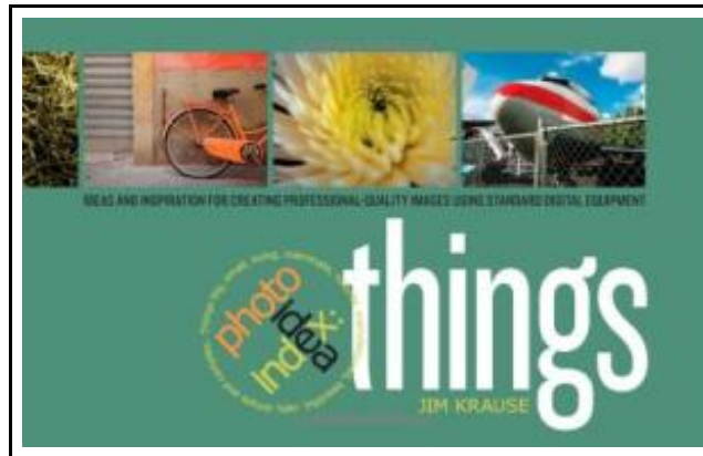
Photo Idea Index - Things: Ideas and Inspiration for Creating Professional-Quality Images Using Standard Digital Equipment